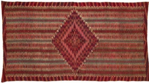
Classic Saltillo Sarape, ca. 1800 Dyed with cochineal and indigo