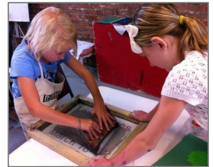
Printmaking in the 2013 Summer Camp

Art About Me for ages 4–6. June 30–July 2, 1–2:30 p.m. $40.50 DAC members, $45 non-members. It's all about you! In these three days, you'll work on drawings, paintings and collages of your favorite things, then you'll create a journal to put them all together.