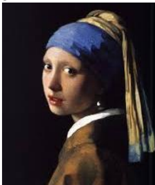
Jan Vermeer "Girl with the Pearl Earring" ca. 1665