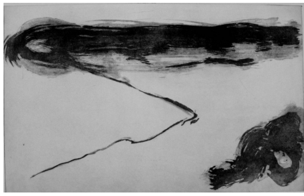
' A B