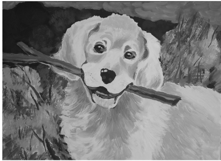
Cheryl Berglund, "Fetch," watercolor & collage