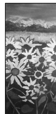
December, Autumn Cameron